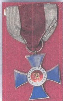
An NOUS medal found on eBay in 2001 with number 44

The Order has a unique provision for membership based on lineal descent, which ensures a strong continuing interest in the deeds and accomplishments of Companions and forbears in perpetuity.