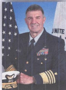
Admiral Karl L. Schultz USCG (Ret)

Distinguished Sea Service Award Recipient