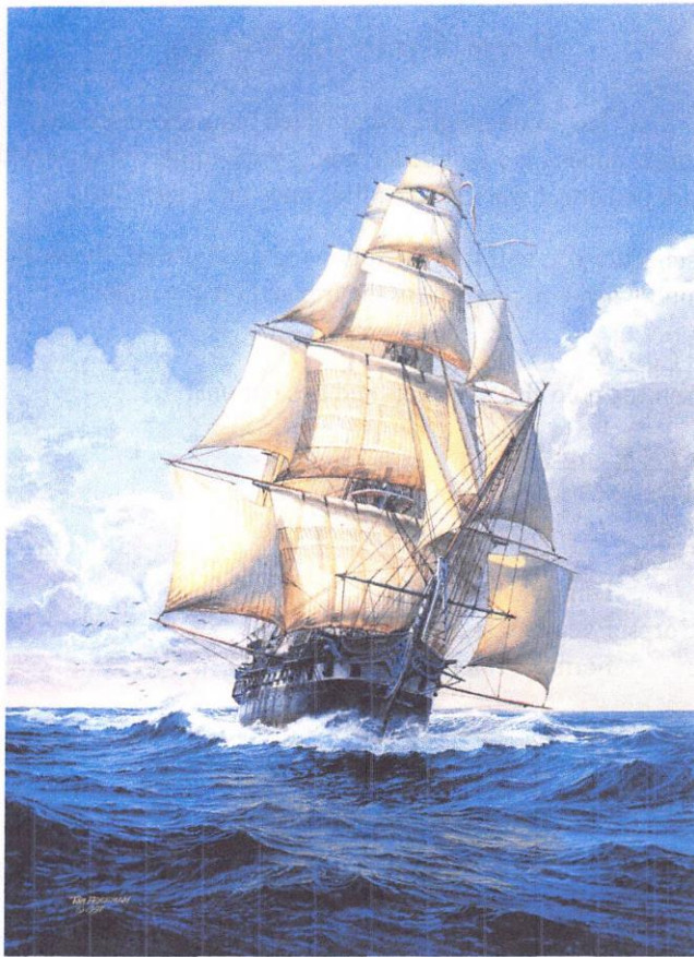
USS Constitution Honorary Naval Order Flagship

Join us in 2024 at the 134th Naval Order Congress